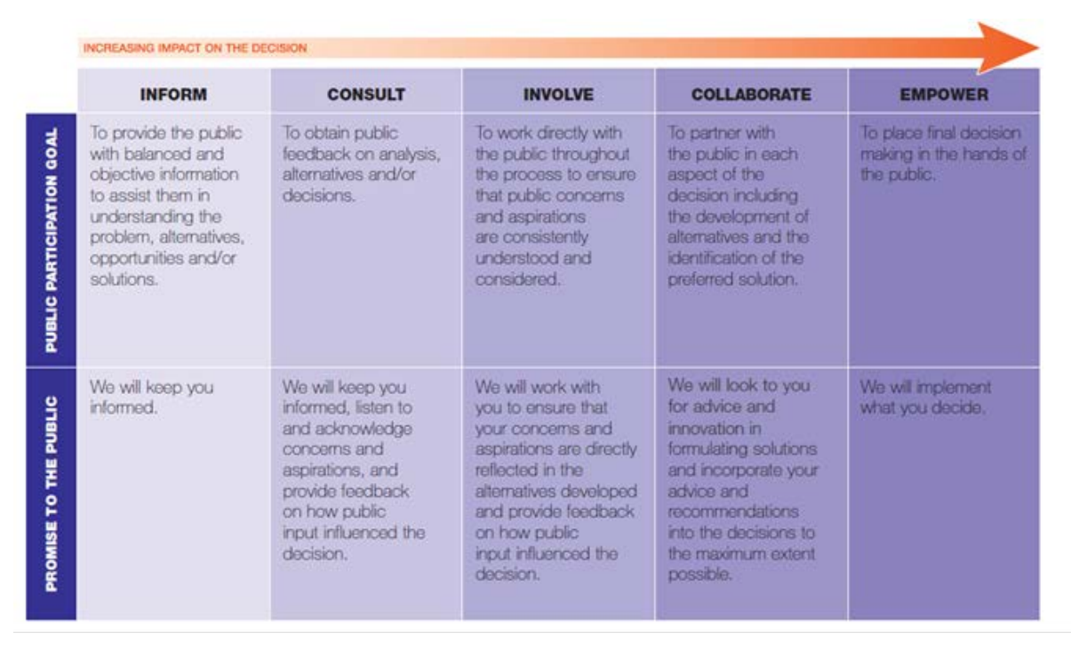
Figure 29-1 IAP2 Engagement Spectrum

Powerlink Queensland is committed to establishing and maintaining respectful and cooperative engagement of Traditional Owners (Native Title holders) and providing effective recognition, protection and conservation of Aboriginal and Torres Strait Islander cultural heritage. During the engagement processes, Powerlink Queensland has sought input from the relevant Native Title holder groups. Subsequent face-to-face meetings have also been held with each group to provide them with further information about the Project, seek early advice about any known constraints and understand each group's preferred engagement approach. Advice was also sought from the Department of Aboriginal and Torres Strait Islander Partnerships Cultural Heritage Unit on any known local matters of interest. Powerlink Queensland will meet its Duty of Care under the Aboriginal Cultural Heritage Act 2003 through the negotiation of formal agreements or Cultural Heritage Management Plans (CHMPs) with each of the relevant Aboriginal Parties (Native Title holders).