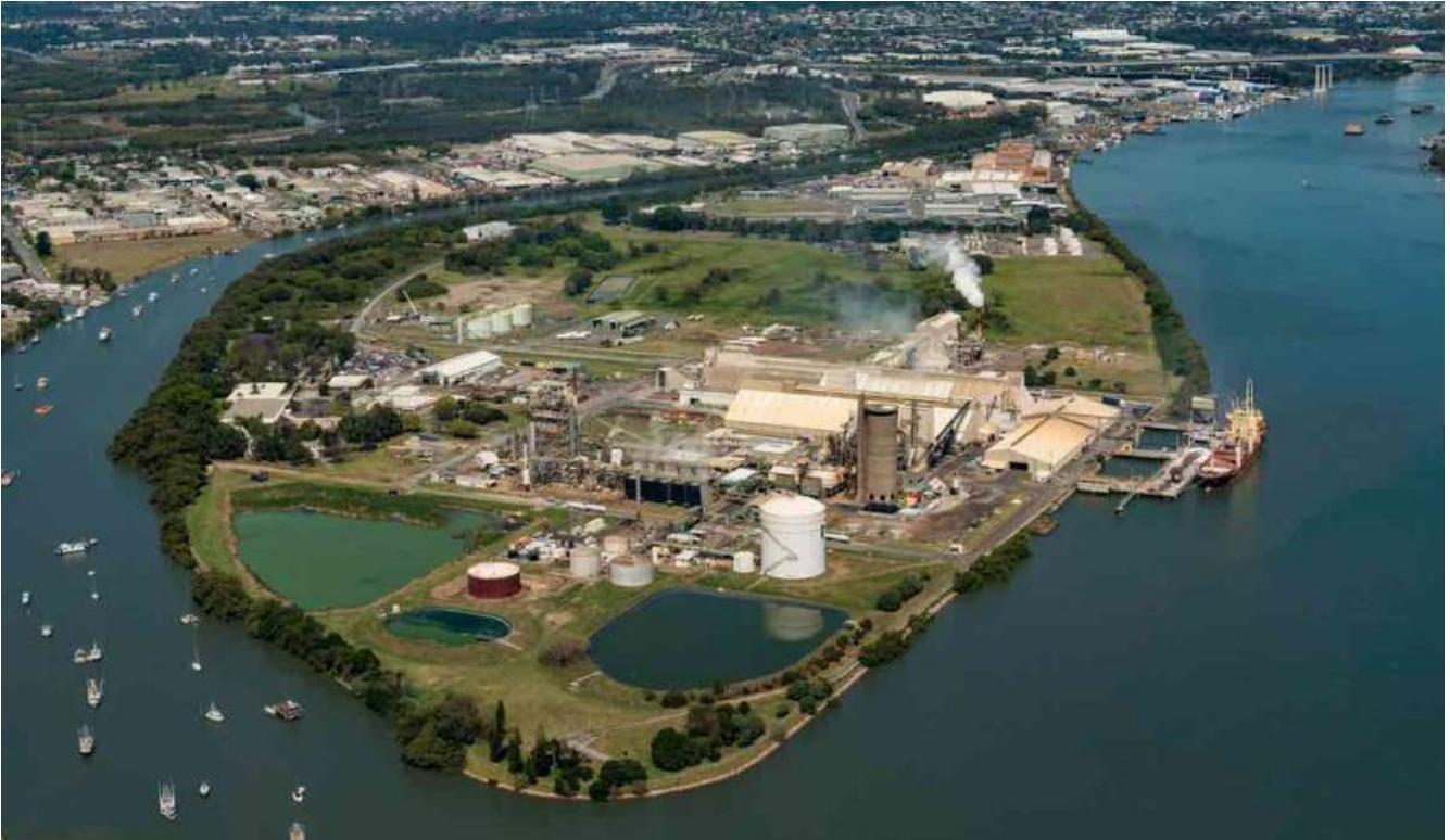
Figure 1 Gibson Island, Brisbane

Connection to Powerlink's transmission network by means of a network augmentation is required to allow electricity produced by renewable generation to power the proposed project.