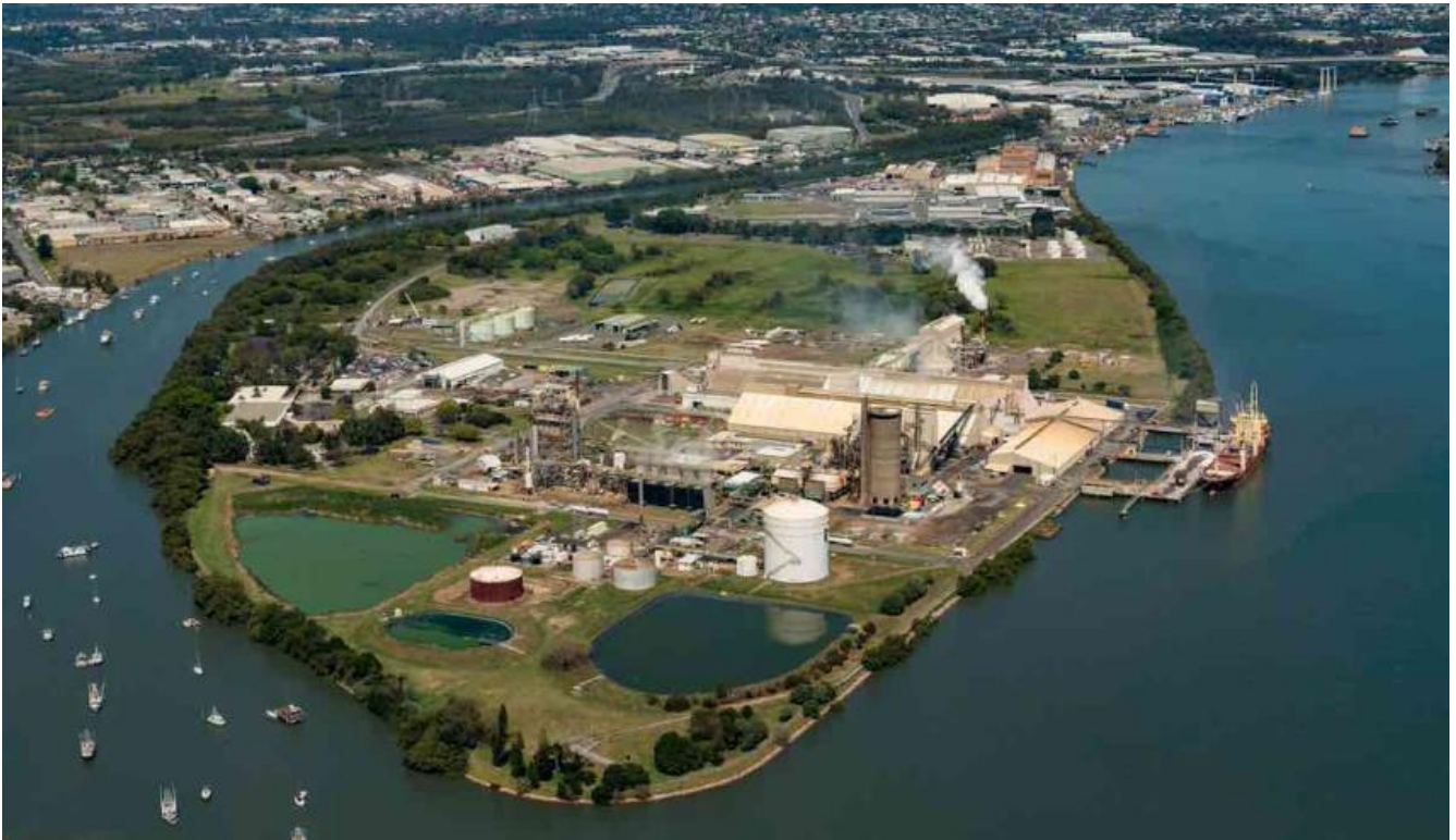
Figure 1 Gibson Island, Brisbane

Connection to Powerlink’s transmission network by means of a network augmentation is required to allow electricity produced by renewable generation to power the proposed project.