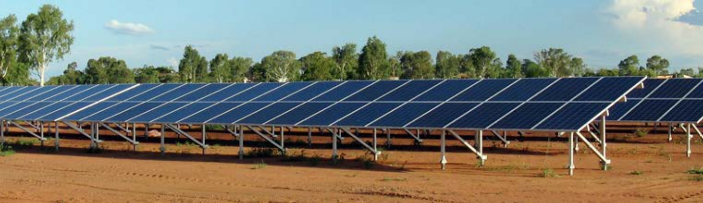
Doomadgee Solar Farm