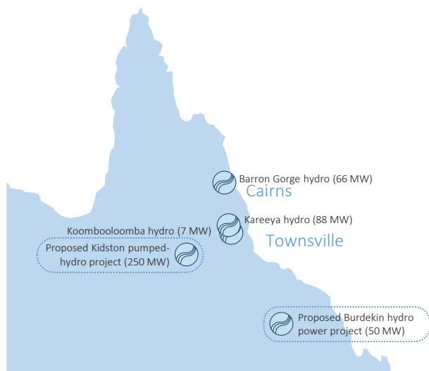
Existing and proposed hydro-electric facilities in North Queensland

To assess this potential, the Queensland Government will undertake a feasibility study to assess options for the deployment of new hydro-electric and pumped storage generation capacity in the state.