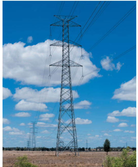
The proposed Wandoan South to Yuleba North transmission line (the subject of this newsletter) is expected to look similar to this steel tower transmission line located near Warra.

Each section includes two projects with separate EIA processes currently under way. To receive information about any of these related projects and associated timelines, you can register for updates via the project pages on the Powerlink website (go to 'Projects/Southern/Wandoan South to Eurombah').