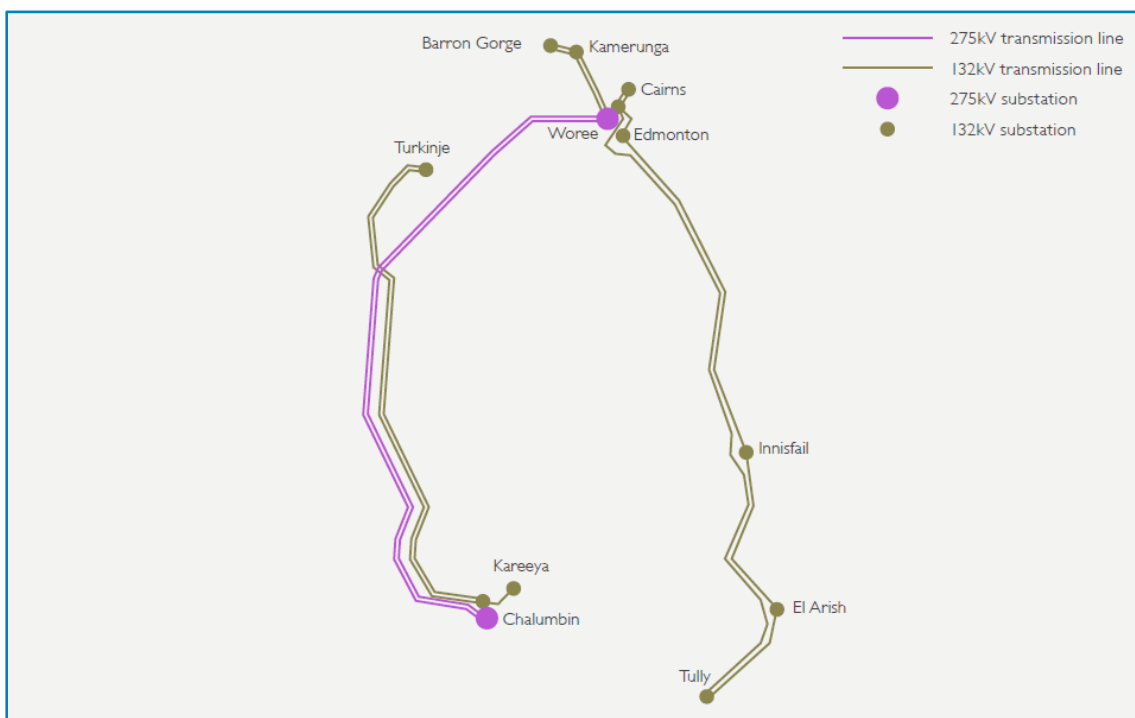
Figure 2.1: Far North zone transmission network

In 2005, a 132kV Static Var Compensator (SVC) was installed to improve the transfer of electricity across the Far North zone network by reducing losses and stabilising power flows. A second 275/132kV transformer was installed in 2007.