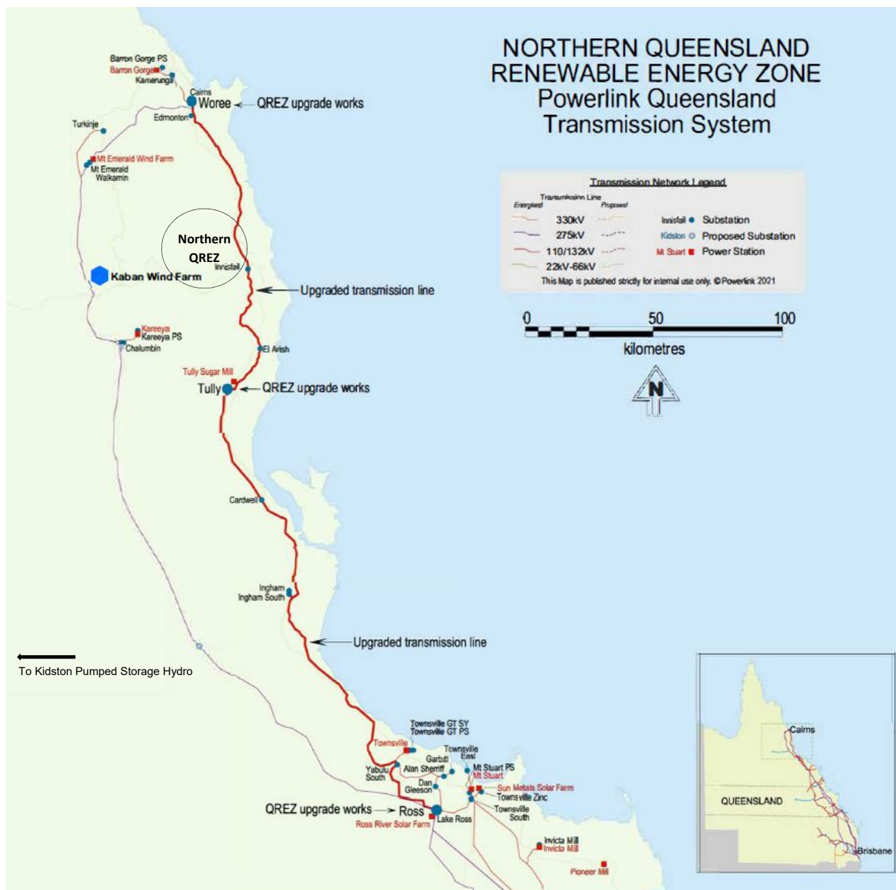
Figure 1 Proposed Northern Queensland Renewable Energy Zone