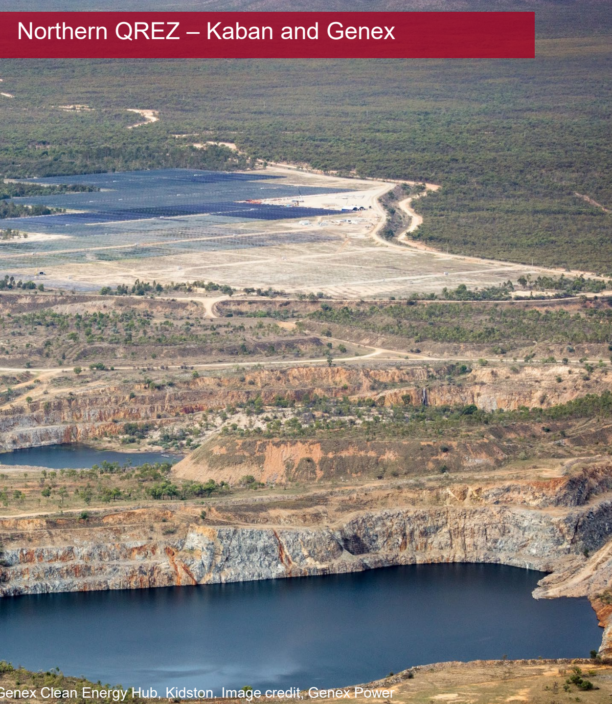
Genex Clean Energy Hub, Kidston.