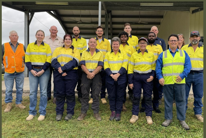
Trainees attending the agricultural machinery training course.