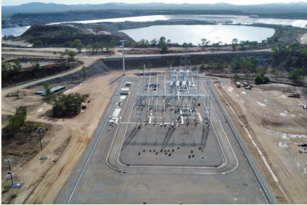
Aurumfield Switching Station