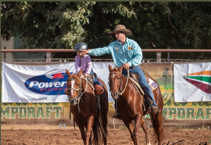
Greenvale Campdraft participants.

For more information about Powerlink's community investment activities, please contact community@powerlink.com.au or visit www.powerlink.com.au/community-investment .