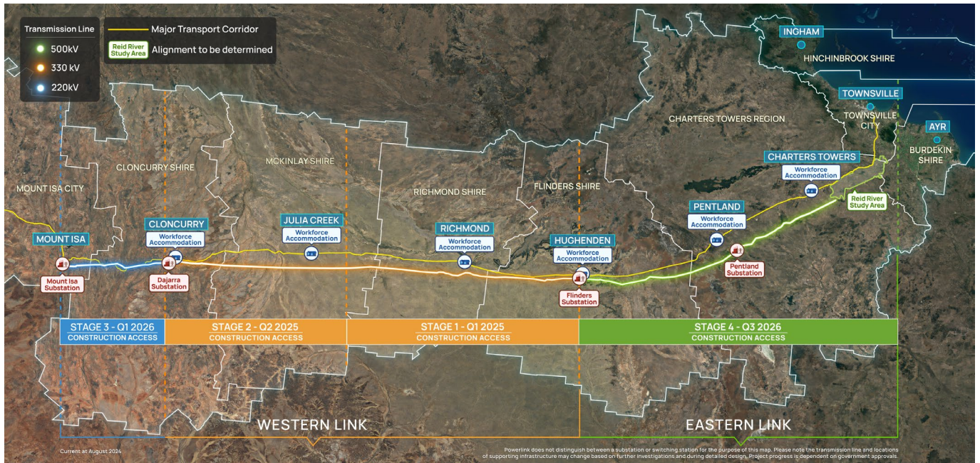
Figure 1: Project map and staging