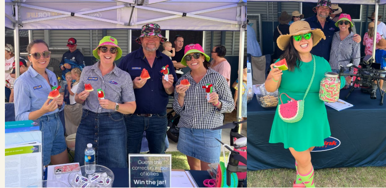
Powerlink team members helping to set up and host an information stall at the Chinchilla Melon Festival in February 2025.

Our team members have enjoyed volunteering to support local events in the community over the past few months.