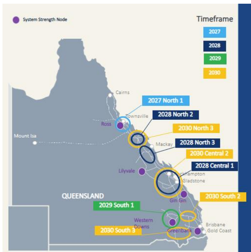
Figure 2: Indicative areas for efficient system strength solutions

Figure 2 shows the indicative areas for efficient system strength solutions, with the only change from the PADR being the timeframe for the North 1 area changing to 2027 (from 2026).