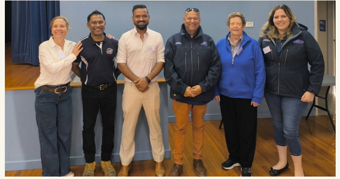
A recent Supplier Capability Development Program workshop