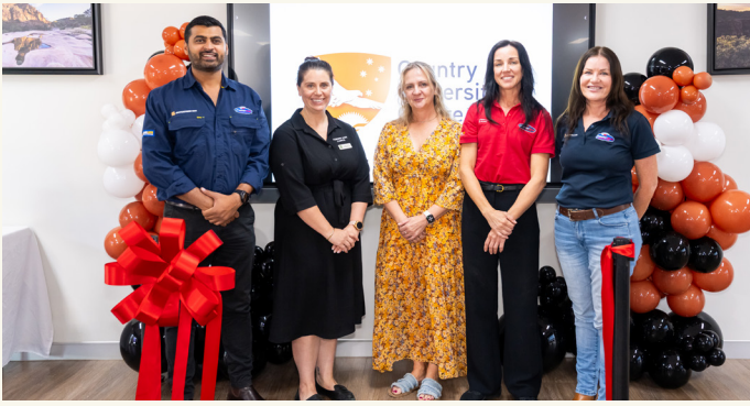
Official launch of Hughenden Country Universities Centre