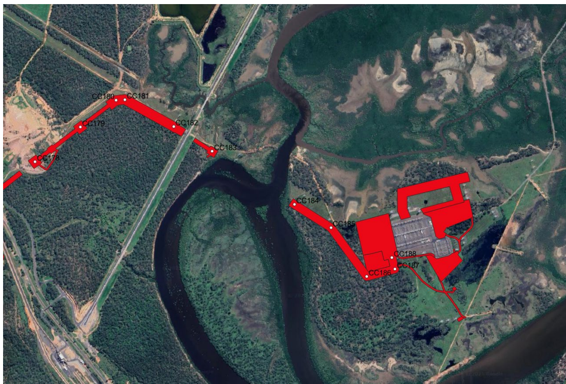
Figure 1. Location of proposed alignment and Calliope River Substation expansion.

Works in Section E will involve vegetation clearing and ground disturbance. In addition, the existing Calliope River Substation will be expanded (Figure 1). Construction of the transmission line is scheduled to commence in June 2026 and expected to conclude by late 2028.